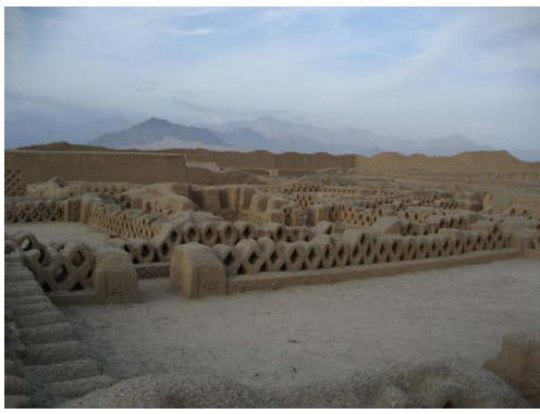
Chan Chan, Peru, South America